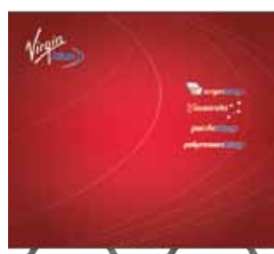
Customised Great Wall Banner Packages