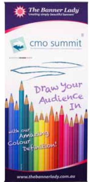
1m (w) x 2.2m (h) Straight Banner Package Printed on Satin Material

We strive to be the premium provider of the highest quality products for all budgets. We would be delighted to talk with you regarding your branding requirements and develop a tailored solution that meets your unique needs.