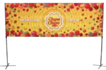
Horizontal Banner Packages

and many, many more! Contact us, or visit our website at www.thebannerlady.com.au to see what solutions we have to suit you!