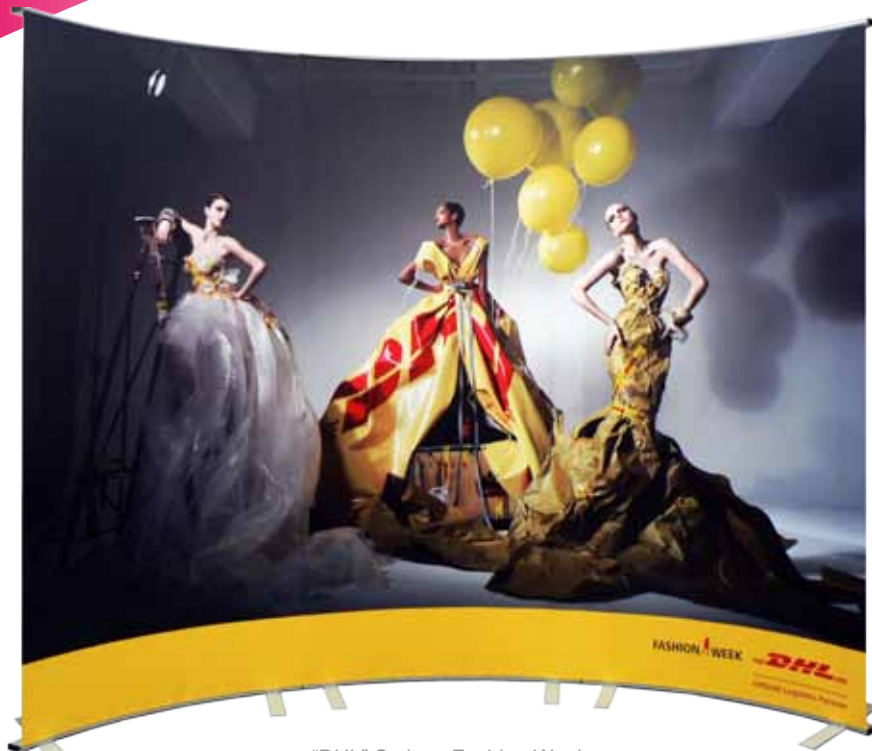
"DHL" Sydney Fashion Week Curved Concave Great Wall Banner Package 3m wide x 2.2m high, Satin Material.

Our Premium Range of beautiful satin display banners are the market leaders and unsurpassed in quality and professionalism.